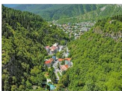
26.08-Day 3: Tbilisi - Gudauri - Kazbegi - Tbilisi

≈7-8 hours | 330 km | Overnight in Tbilisi